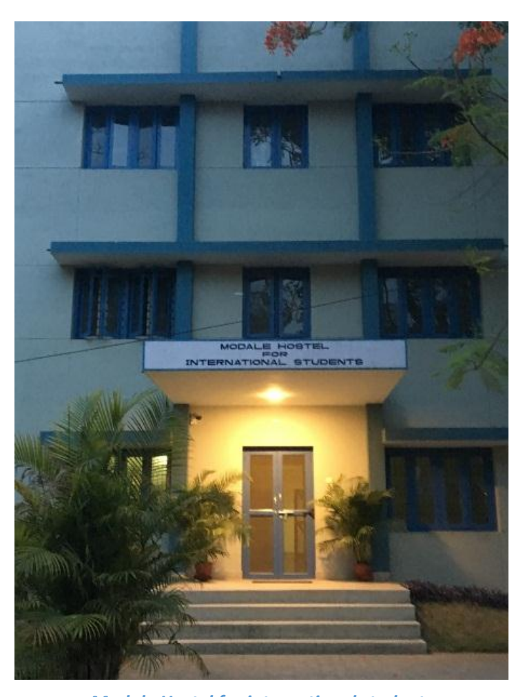
Modale Hostel for international students