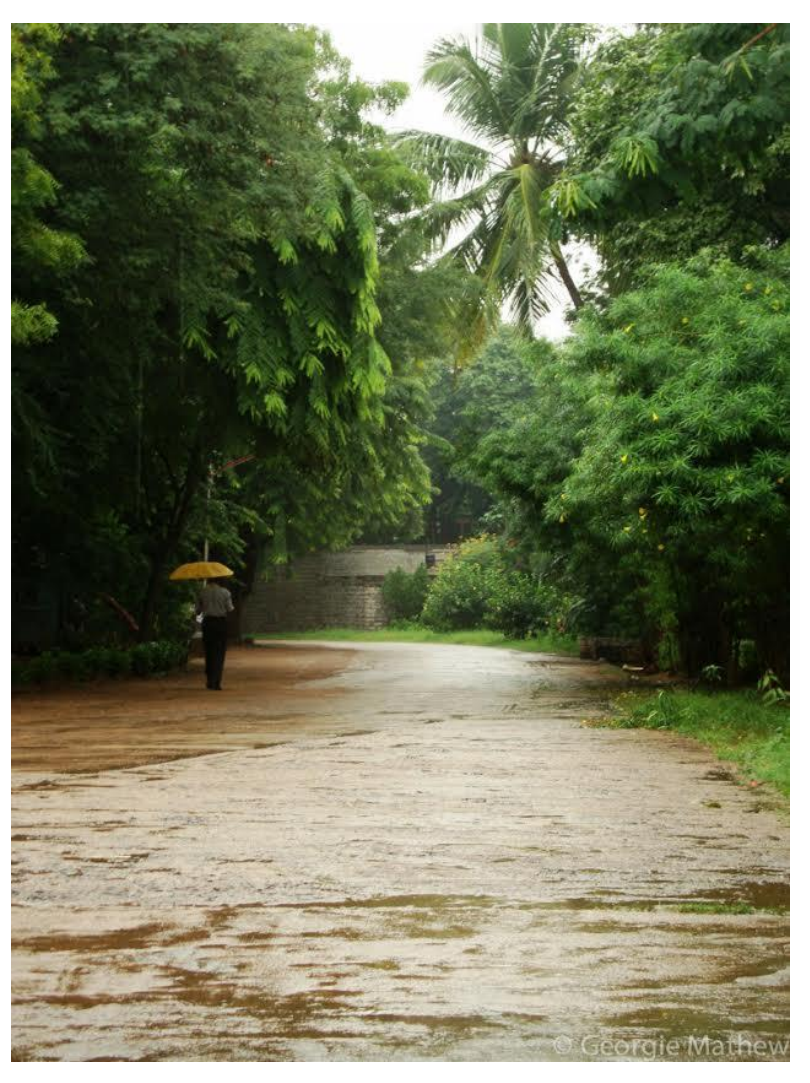
College Campus, on a rainy day