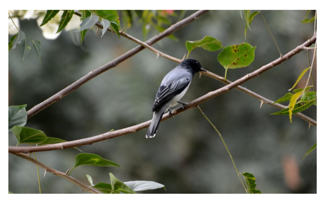
Black-headed cuckooshrike, commonly seen on the College Campus