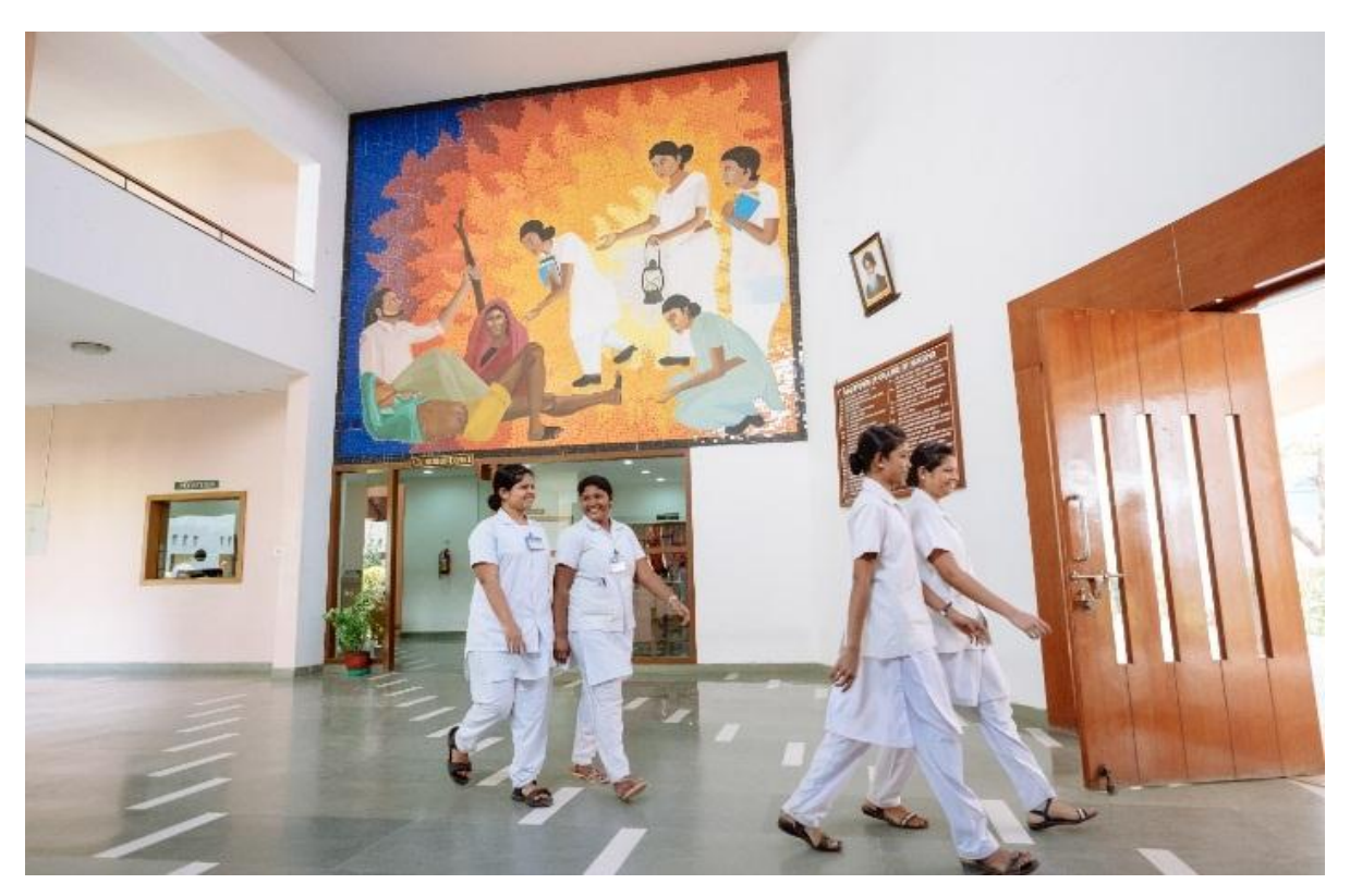
Foyer of the College of Nursing