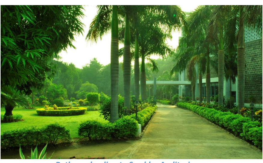
Pathway leading to Scudder Auditorium, located at the College Campus

More views of the College Campus and the Kagithapattarai Campus