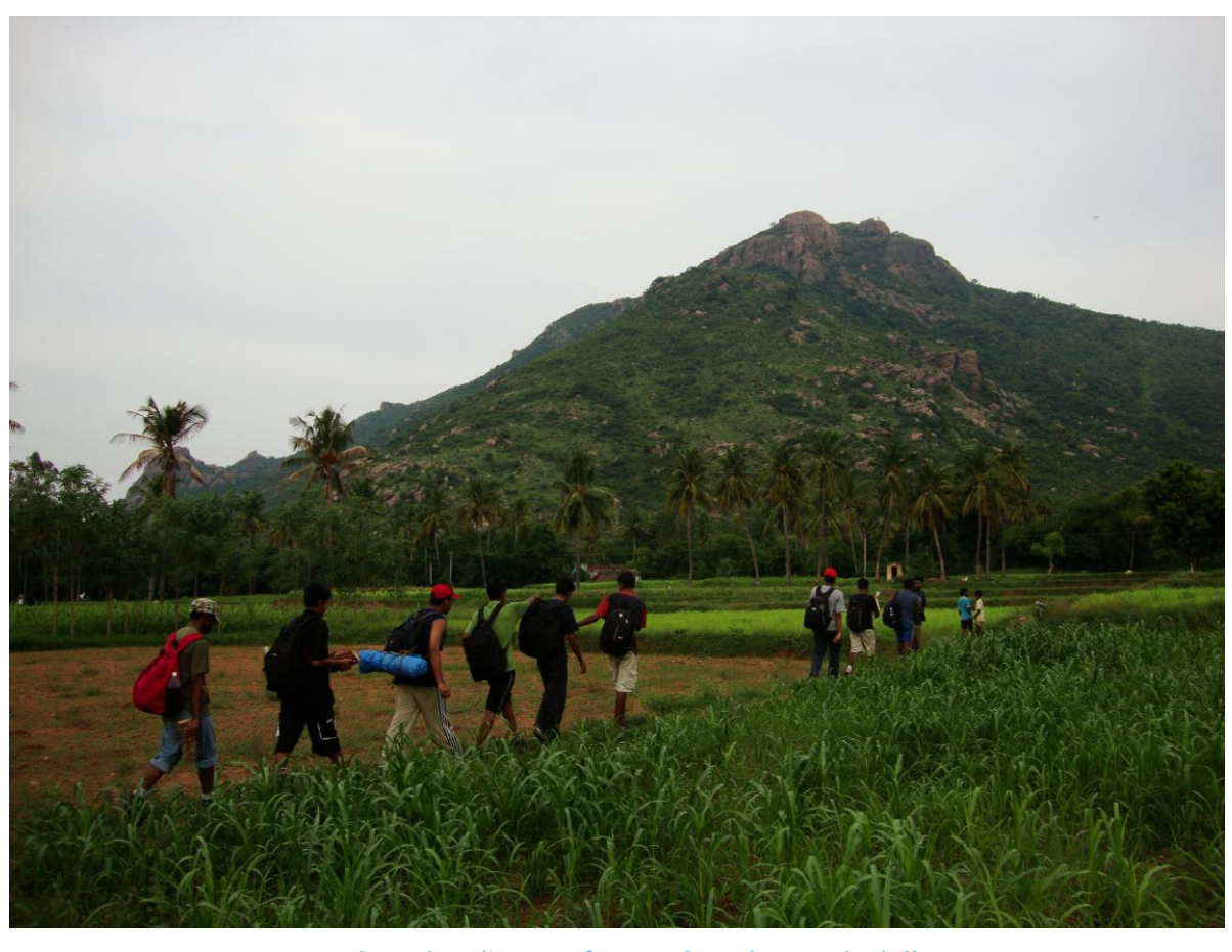
Students heading out for a trek to the nearby hills