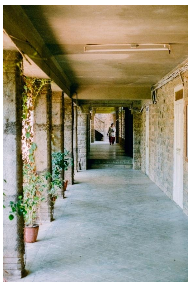
Stone corridor in front of the chapel

The Medical College Campus on the southern outskirts of Vellore city is a twohundred-acre wooded site at the foot of College Hill. Built in 1932, it remains, as