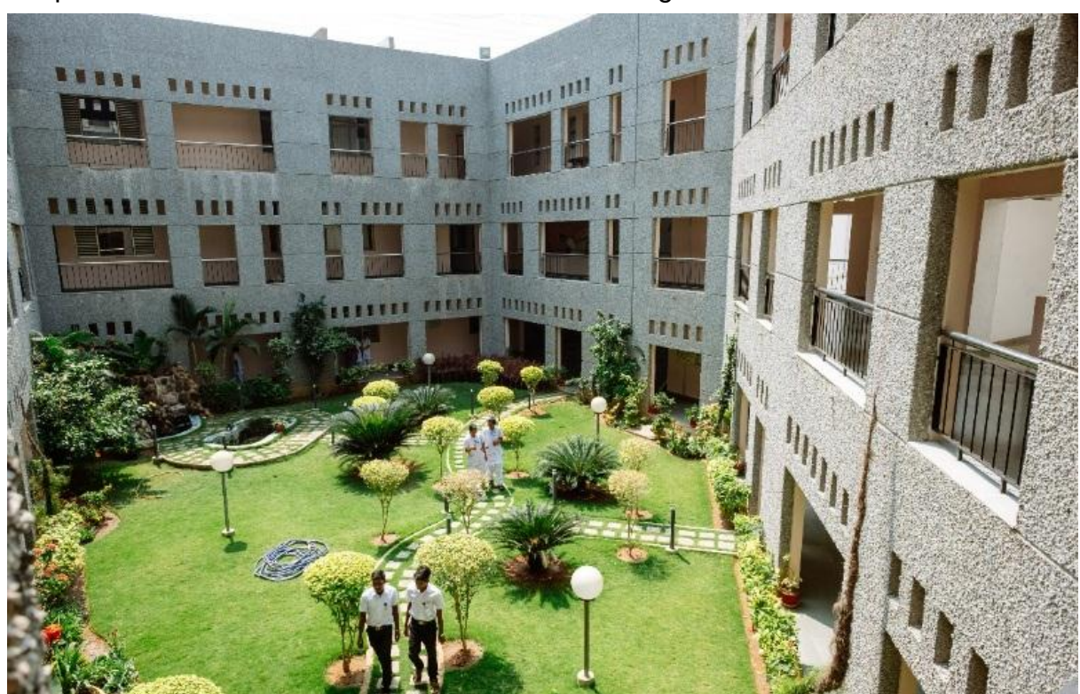
College of Nursing

In December 2009, the centenary year for nursing education, College of Nursing moved out of the hospital premises to a sprawling, new campus in Kagithapattarai, very close to the hospital. Apart from the College with its administrative offices, spacious classrooms, a digital library, and a conference room, the campus has a chapel as well as residences for medical and nursing staff.