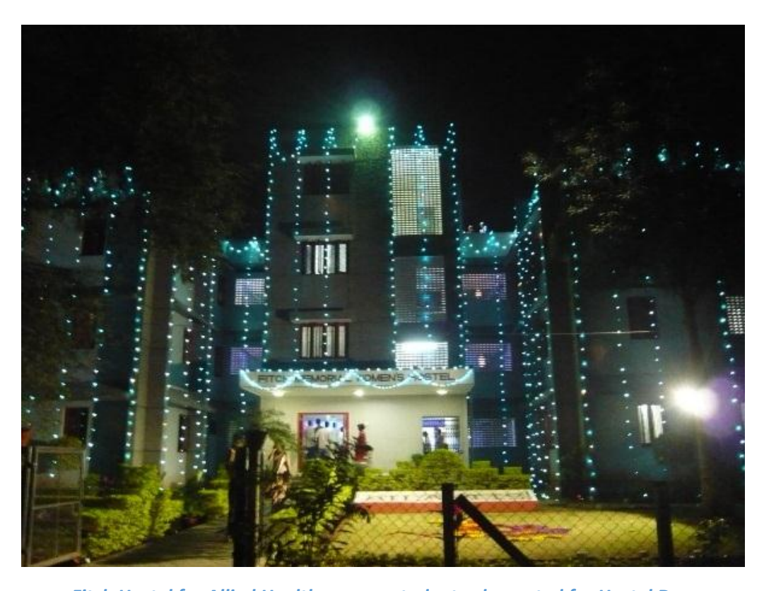
Fitch Hostel for Allied Health women students, decorated for Hostel Day