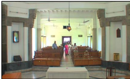
Inside the hospital chapel

The spiritual development of the students is encouraged through opportunities for regular community worship on Sunday evenings in the college and hospital chapels. Students