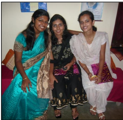
Inside a student room, Women's Hostel

The Bagayam Campus has the Women's and Men's Hostels for MBBS students, the Fitch Hostel for Allied Health girls, the Dorothy Joske Hostel for boys and the Modale International Hostel for elective/ visitor-observer students from overseas. Besides the hostel messes the College Canteen and the Stores also serve food, ice cream and beverages. The nursing students live in the Student Nurses Hostel in the hospital campus, which is the largest hostel. Staff nurses and interns have separate hostels.