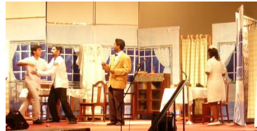
College Day Play 2010

The students put up plays, musicals and special events periodically, with the help of appropriate staff members. These include the annual College Day Play, which is often a well-known musical, and music, dance and cultural competitions. The staff also take the stage occasionally with a highly entertaining Staff Entertainment.