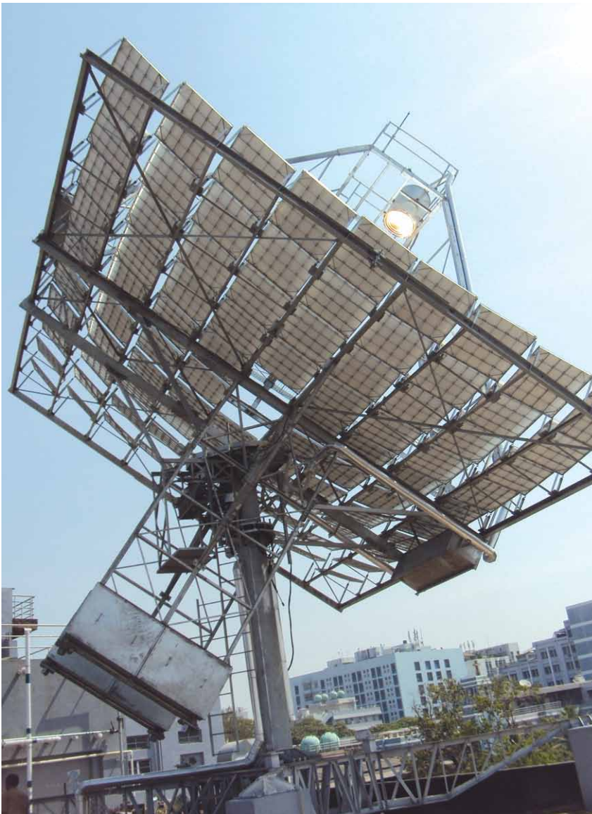
Solar Panel for Water purification system