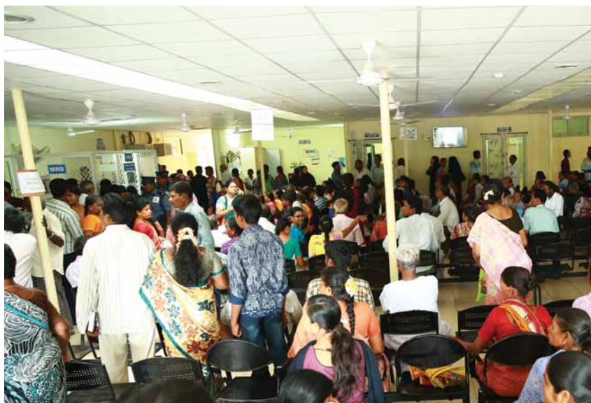
A busy OPD day at the Chittoor Campus

Outreach programmes for primary health and schools were initiated in the district. and educational workshops conducted. In the coming year, plans are on to initiate CMAI related courses and set up a dialysis unit.