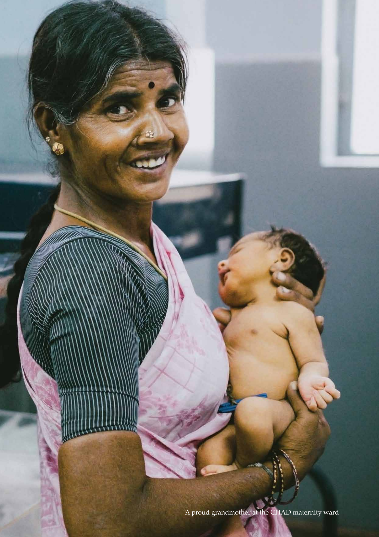
A proud grandmother at the CHAD maternity ward