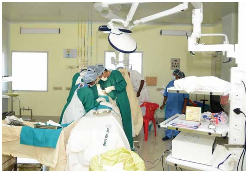
One among the four operation theatres at Chittoor