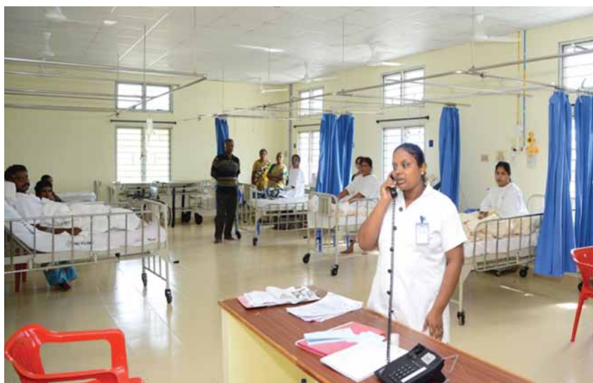
A large and spacious ward at Chittoor