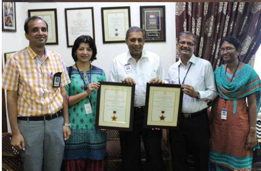
The Skoch Swasth Bharat Awards 2017