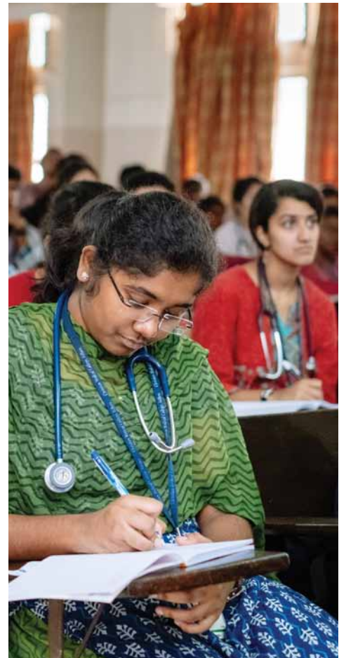
Class in session at the College of Nursing