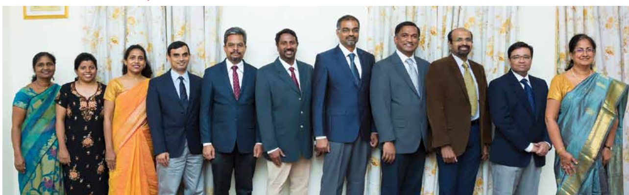
The Deputy Directors