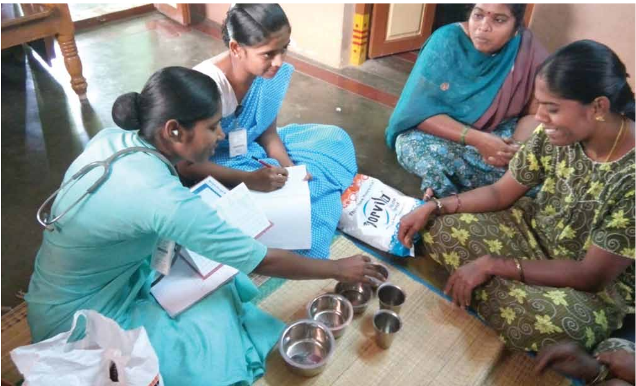
Home visit from College of Nursing Community Health (CONCH)