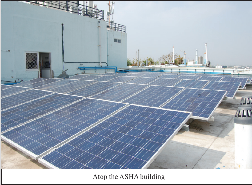
Atop the ASHA building

S olar photovoltaic (PV) systems are renewable energy systems which use PV modules to convert sunlight into electricity. The electricity thus generated can be stored in batteries, used directly or fed back into a grid line. The Solar PV system is a reliable and clean source of electricity that can suit a wide range of applications such as residence, industry, agriculture, commercial use and so on.