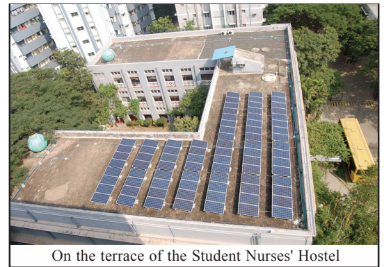
On the terrace of the Student Nurses' Hostel

Eight Solar power plants have been installed at hospital campus by the Electrical Department, totalling 214 KW . The first Solar PV power plant on campus was installed on the OPD roof top in July 2013 at a capacity of 50 KW. The total energy generated upto December 2016