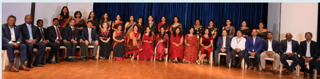
MBBS batch of 2000