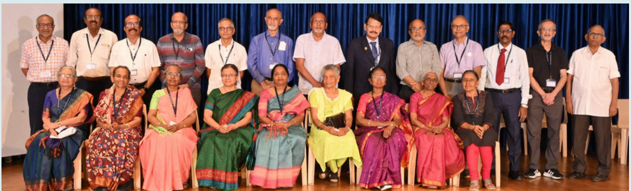
MBBS batch of 1970