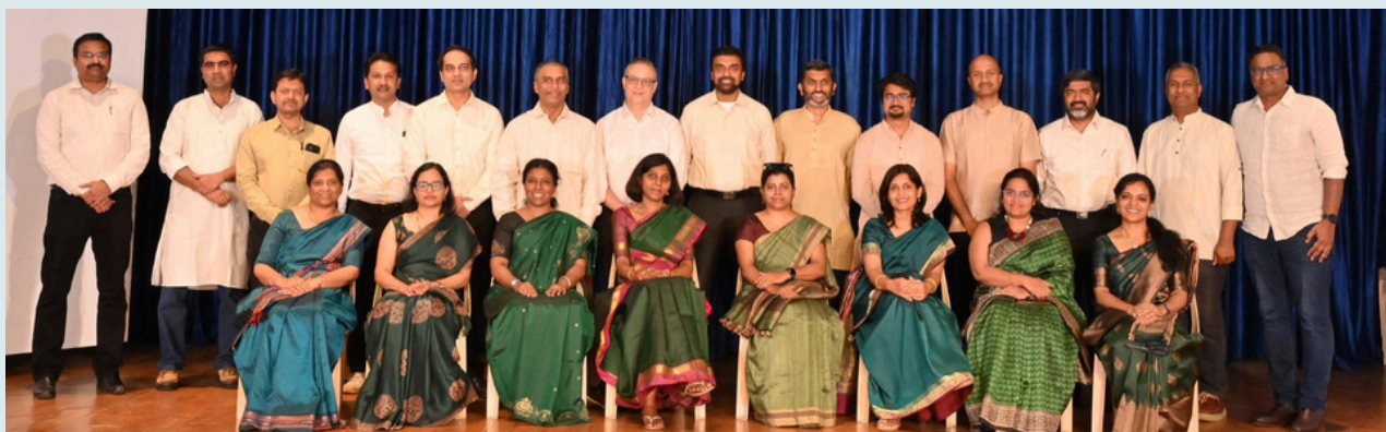
MBBS batch of 1995