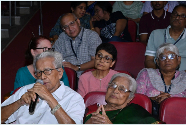
MBBS batch of 1950 (with family member)