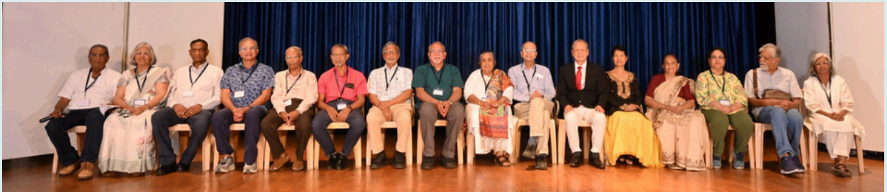
MBBS batch of 1965