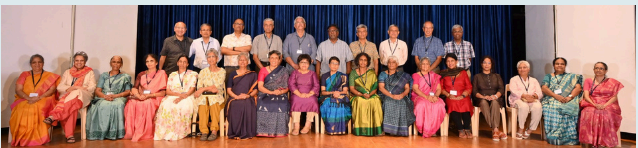
MBBS batch of 1975