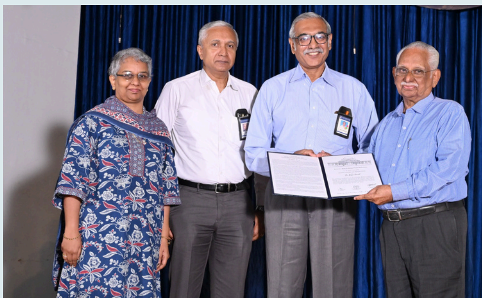
Alumni award 2025