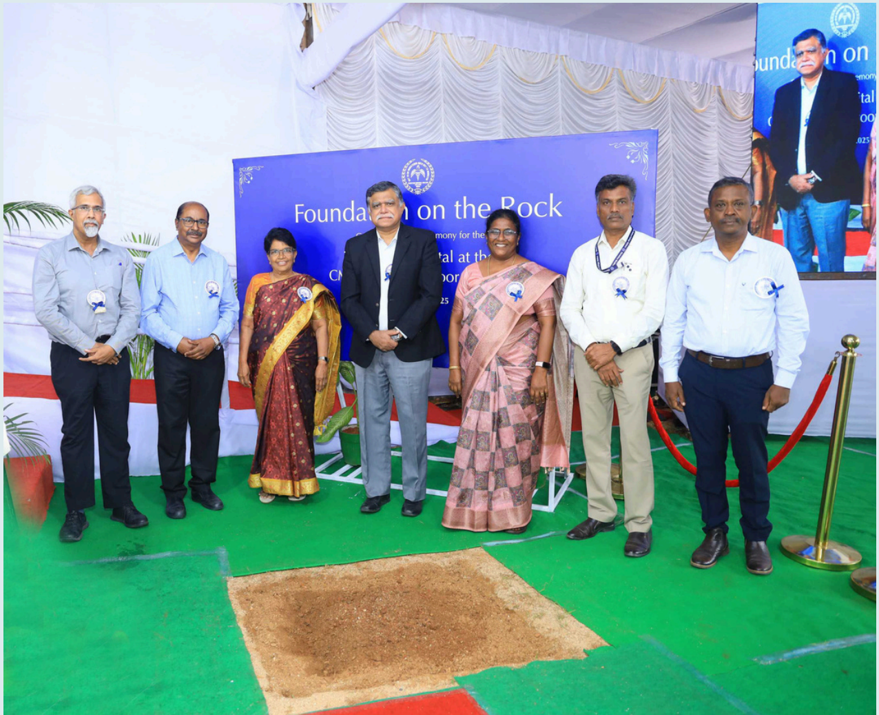
Former Administrators of CMC Vellore, Chittoor Campus