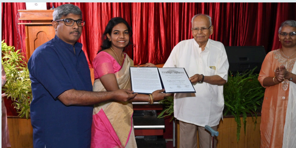
College Motto award 2025