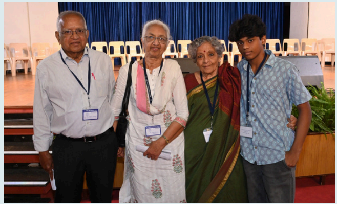
MBBS batch of 1960 (with family members)