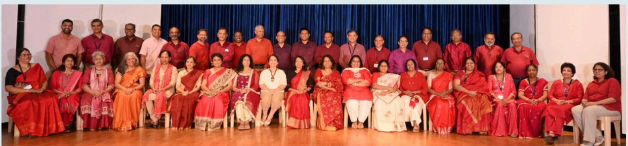
MBBS batch of 1985