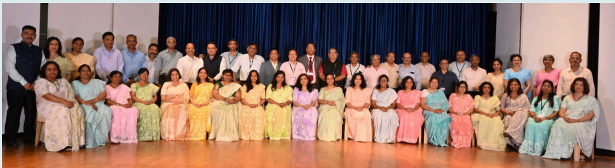
MBBS batch of 1990