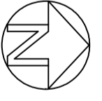
Third Floor Key Plan